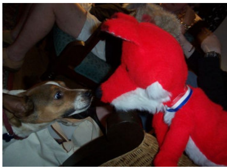
Sherlock the Dog meets Reynard the Red Fox